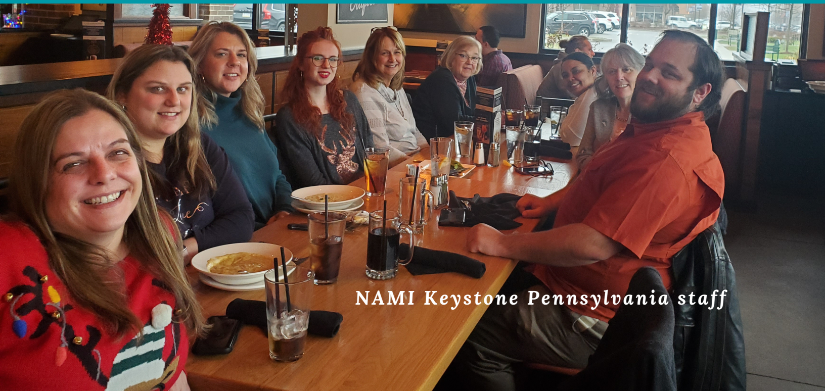
NAMI Keystone Pennsylvania staff